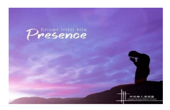
God's household is the church of the living God, the pillar and foundation of the truth. (1 Timothy 3:15b)