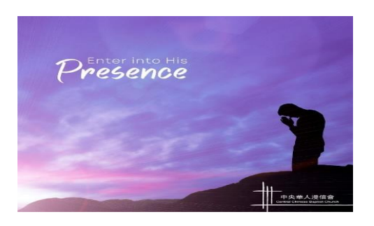
God's household is the church of the living God, the pillar and foundation of the truth. (1 Timothy 3:15b)