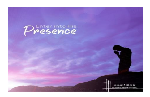
God's household is the church of the living God, the pillar and foundation of the truth. (1 Timothy 3:15b)