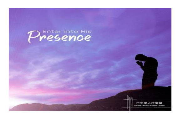
God's household is the church of the living God, the pillar and foundation of the truth. (1 Timothy 3:15b)