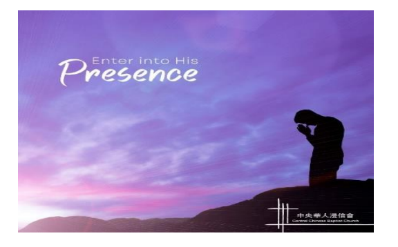
God's household is the church of the living God, the pillar and foundation of the truth. (1 Timothy 3:15b)