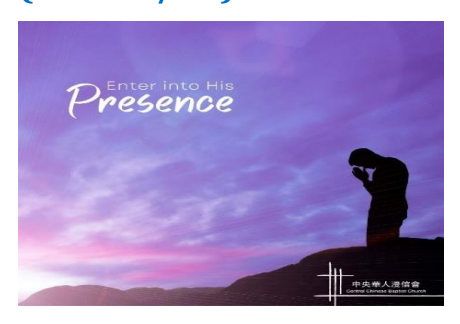
God's household is the church of the living God, the pillar and foundation of the truth. (1 Timothy 3:15b)